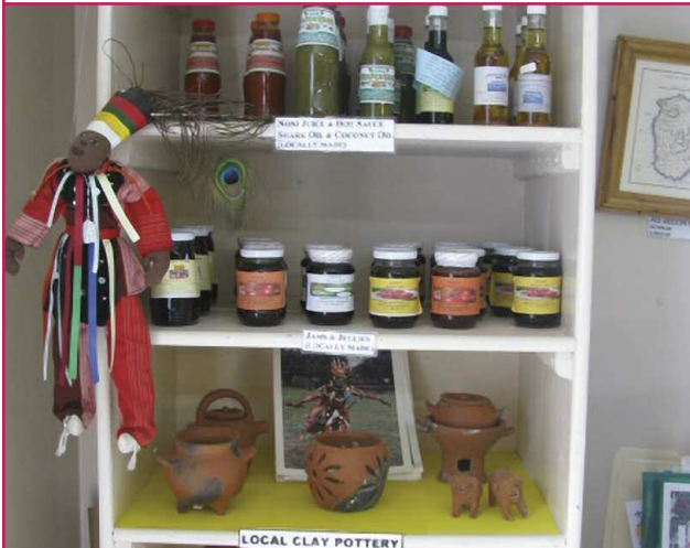
Nevis Historical & Conservation Society's diversified funding strategy includes selling locally made items.

covers its operational costs, including continuous capacity building, as well as any project or programme activity. Of course, there are many other aspects of sustainability, some of which are addressed below.