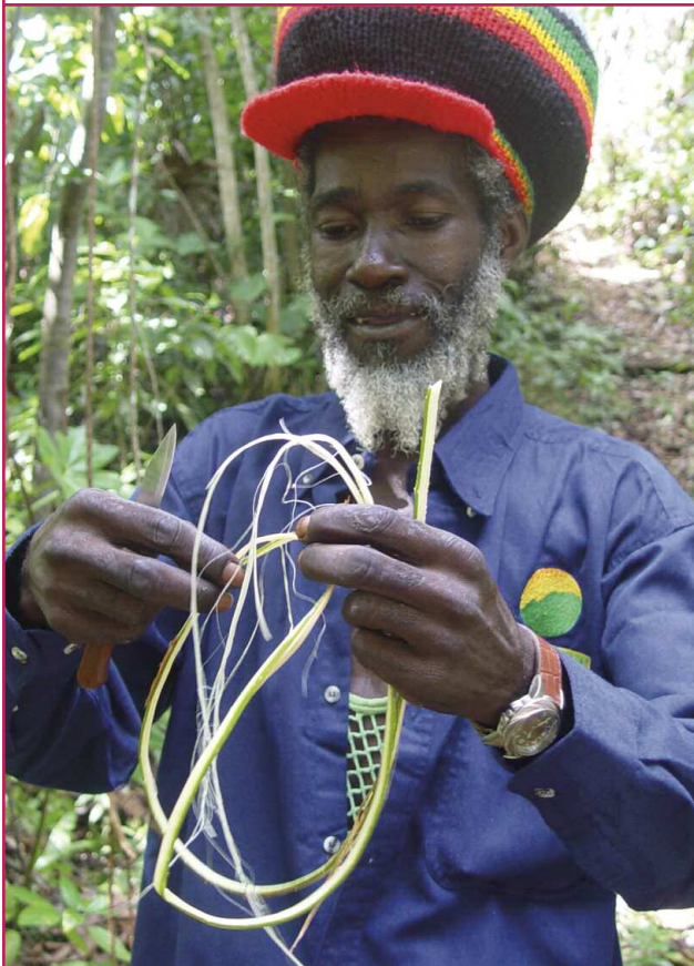
Resource users in rural communities have skills and knowledge that they can contribute to building sustainable livelihoods.