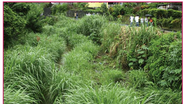
Partners of the Environment, in Chateaubelair Saint Vincent, did a project to clean up a river which was completely choked with elephant grass.

Newly-established CBOs find themselves in a difficult situation, similar to that faced by school or university graduates looking for employment – they don't have the track record to attract funding but without funding, they cannot establish a track record. CANARI has found that small grants, combined with mentoring, can be a winning combination . Both independently, and in collaboration with the International Institute for Environment and Development (IIED), CANARI has experimented with