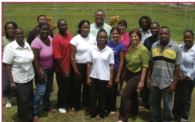
CBO participants at the Tobago Forests and Livelihoods workshop met agencies who could support community development in Tobago, but who were not coordinating their efforts.

objectives. In a series of national workshops in seven countries under its Forests and Livelihoods programme, CANARI invited a wide range of government and private sector agencies to participate in panel discussions where they outlined what they could contribute to community level forest management initiatives. Yet there appeared to be no systematic process or institutional arrangement to coordinate their programmes into a holistic approach to community development, resulting in both duplication of effort and significant gaps. However, it is clear that shared effort and inputs have been a significant enabling factor in the development of the LFMCS and of the environmental management landscape in the Dominican Republic (see Box 7). There is also an increasing number of examples of private sector involvement in catalysing or supporting community-based conservation initiatives (see Box 8).