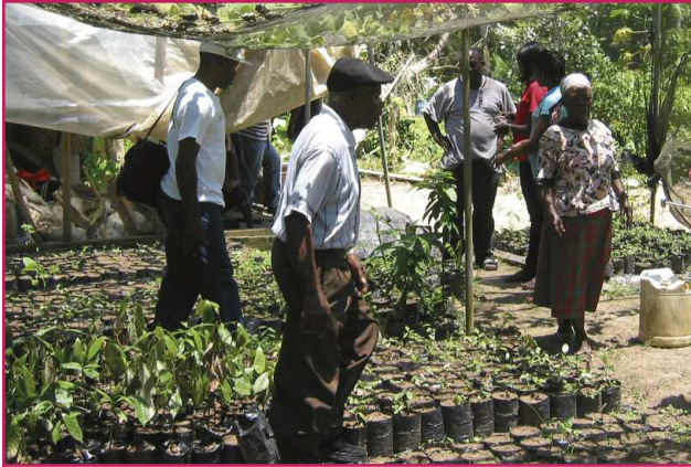
The Pencar Local Forest Management Committee in Jamaica maintains a nursery to provide the Forestry Department with seedlings for reforestation.