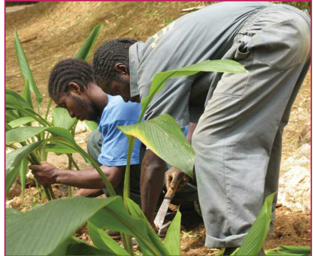
Members of the Fondes Amandes Community Reforestation Project planting in the Fondes Amandes watershed in north Trinidad.

Community participation in natural resource management cannot be effective without an enabling policy environment, not just in areas with obvious linkages such as land use planning, land tenure, agriculture, forestry and fisheries but also in terms of those relating to finance and economic development, social development, community development, civil society capacity building, and heritage