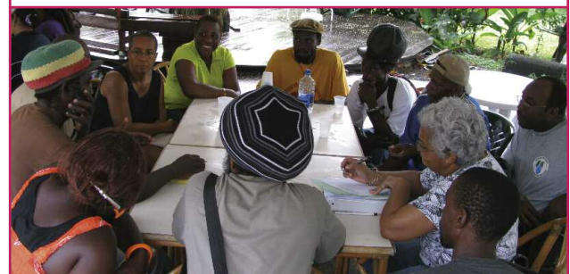
CANARI's Forest and Livelihoods Action Learning Group visited Chateaubelair to learn about the Partners of the Environment project.