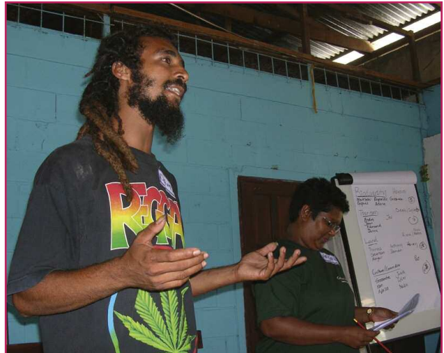
People in communities surrounding the Aripo Savannas were given the opportunity to express their ideas and needs as part of the management planning.

This presents a number of challenges even in a context such as the development of the Jamaica LFMCs where broad community engagement has been enshrined in the project design from the outset (see Box 5). These can be compounded by the fact that the support agencies may be sceptical of, or lack the requisite skills to conduct, such participatory processes. However, while effective community engagement of this kind will generally be a lengthy and iterative process, the livelihood and conservation benefits can be significant, including the fostering of relationships that improve the sustainability of the desired outcomes (see Box 6).