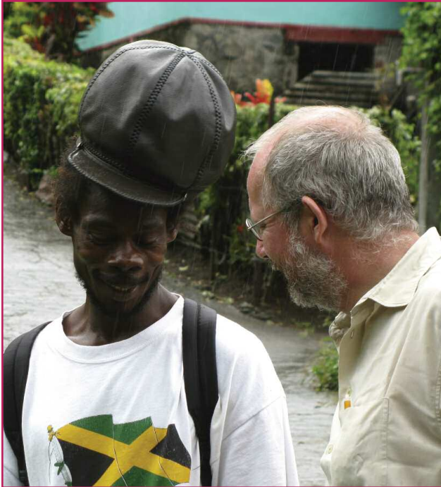
Building relationships between people is an important part of capacity building for participation.