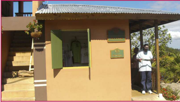
Cockpit Country Local Forest Management Committee manages a visitor centre and conducts tours relating to the area's rich Maroon history.