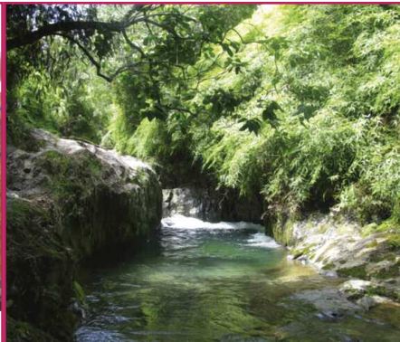
The Ebano Verde protected area in the Dominican Republic managed by the CBO, Progreso.