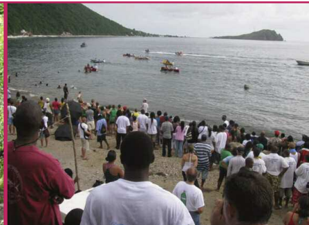
Stakeholders celebrate at a community day in the Soufriere Scotts Head Marine Reserve in Dominica, managed by a multi-stakeholder committee involving government, private sector, and community groups.

giving CBOs 'risk capital' in the form of small grants (US$1500-4000) to pursue small scale projects or capacity building activities, with either informal or formal mentoring. As illustrated by the example in Box 7, the results have outstripped those achieved from much larger investments and have created relationships that are contributing significantly to long-term sustainability.