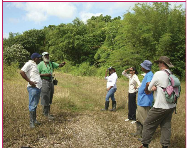
Stakeholders worked together in the field to plan how to manage the Aripo Savannas.