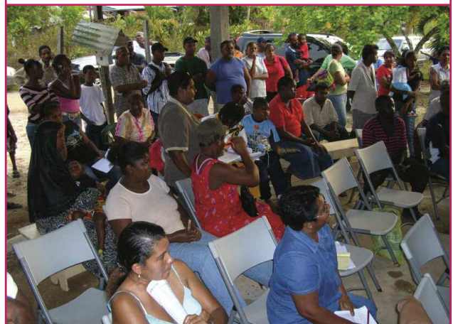
Meetings were held in squatter communities around the Aripo Savannas so that people could get involved in the process.