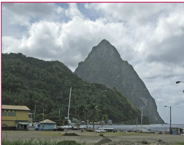
The breakdown of the institutional arrangement for community-based management of Gros Piton tours has enabled a private entrepreneur to take over and reduced the community’s involvement in decision-making and benefit-sharing.

For the purposes of this brief, a financially sustainable CBO is considered to be one that sustains itself through a diversified fundraising strategy (i.e. not over-dependent on a single source but that may include grant funding), which