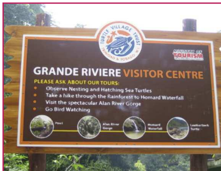
Turtle Village Trust partners with local communities in Grande Riviere and other "turtle villages" in N.E. Trinidad and S.W. Tobago.