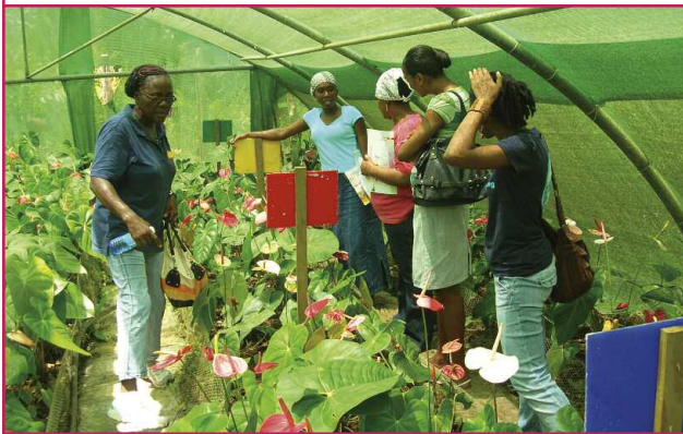
Clozier Youth Farmers of Grenada are producing anthuriums for the hotel industry and building their capacity in nursery management and marketing.